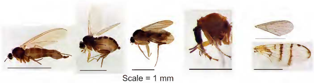
Figure 8: Dipteran (left to right): Sciariidae, Phoridae (2), head and thorax of a black fly Simuliidae, and wings of a fungus gnat Mycetophidae (above) and fruit fly Tephritidae (below). Identification by A.L. Ozerov.